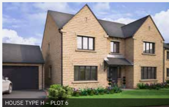
HOUSE TYPE H - PLOT 6