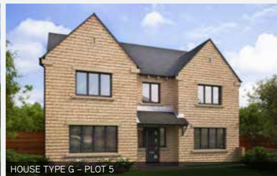
HOUSE TYPE G - PLOT 5