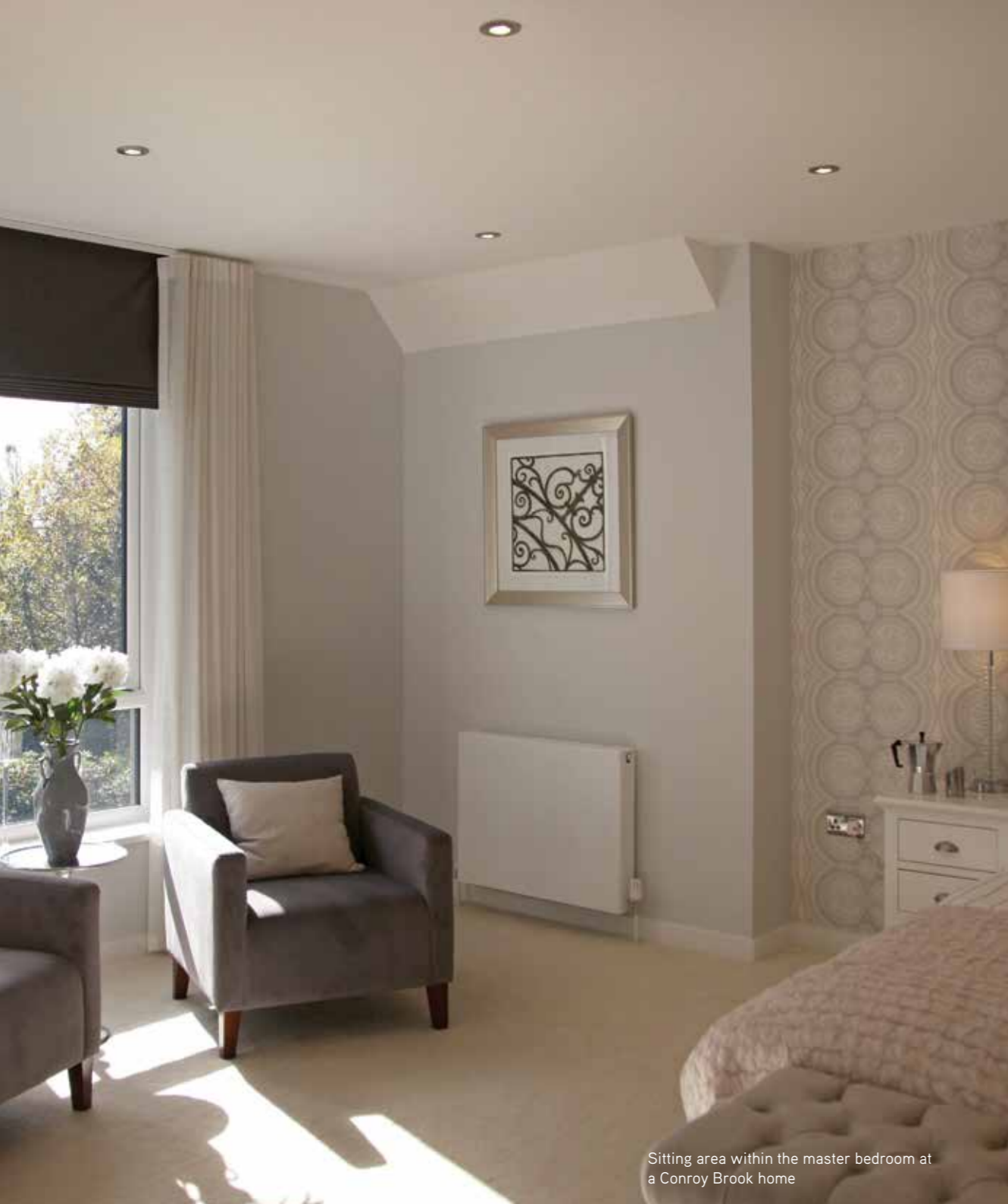
Sitting area within the master bedroom at a Conroy Brook home