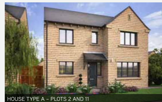
HOUSE TYPE A - PLOTS 2 AND 11