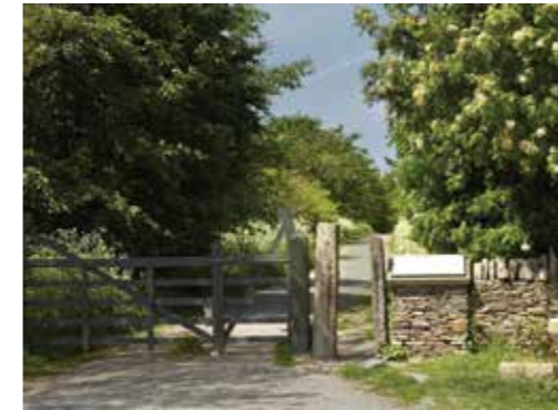
Some of the stunning scenery in and around Ingbirchworth Reservoir.