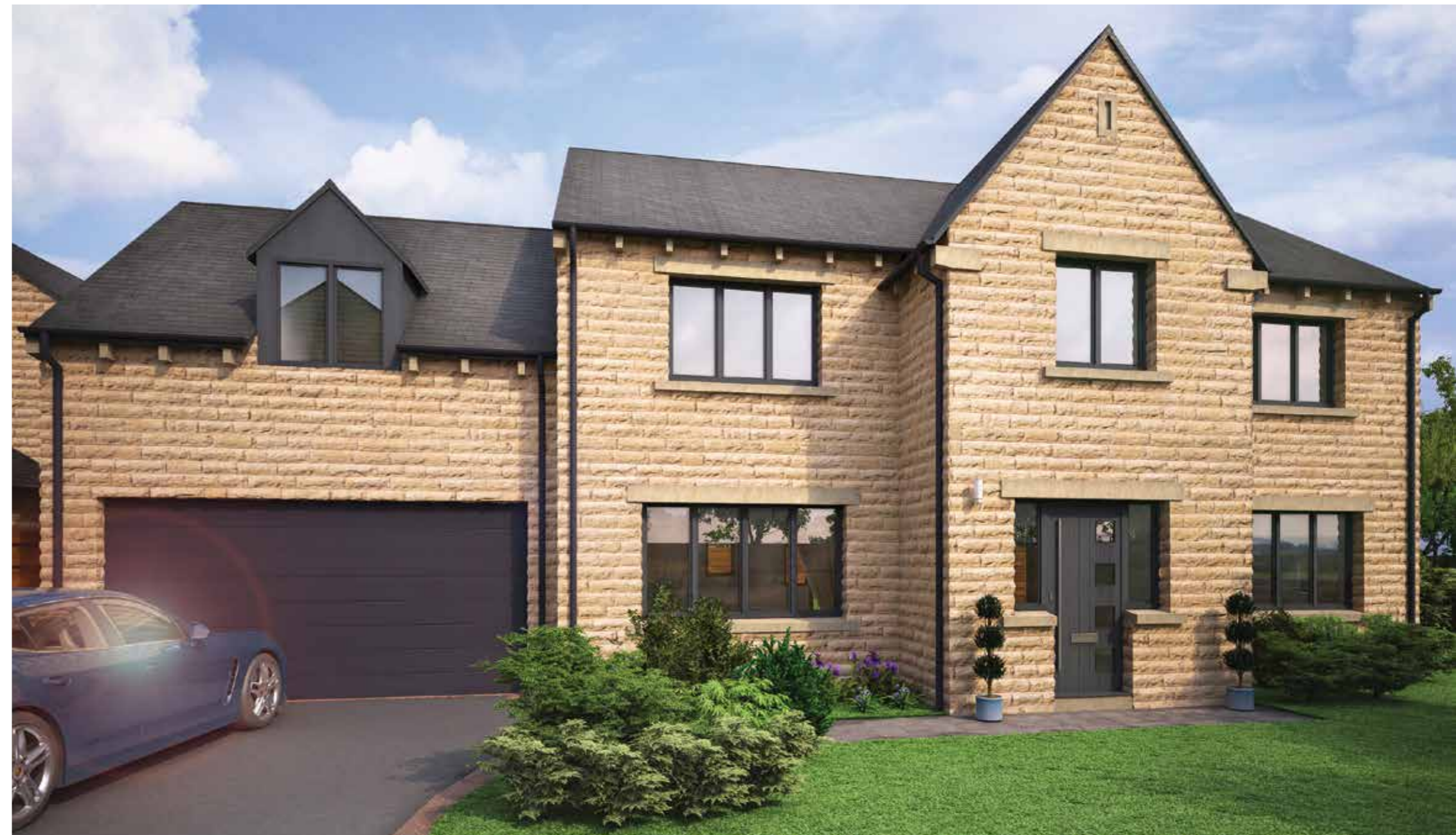
CGI of Plot 8 at SummerFord