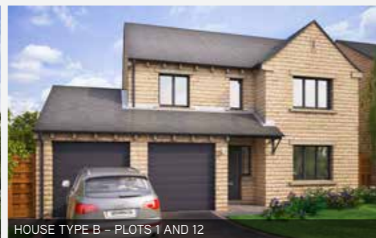
HOUSE TYPE B - PLOTS 1 AND 12