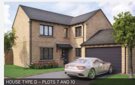
HOUSE TYPE D - PLOTS 7 AND 10