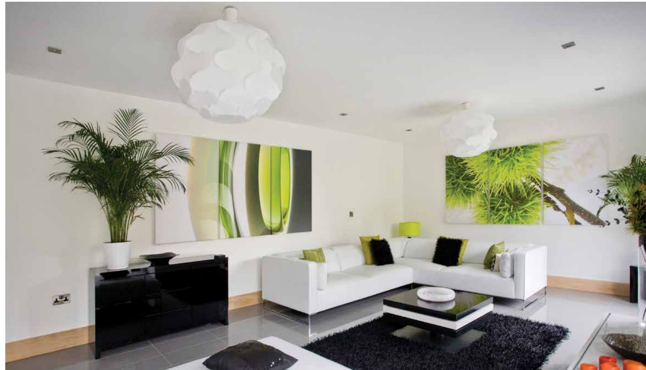
A living room within a Conroy Brook home.

Or the luxurious touch of the ceramics in your bathrooms, the solid feel to the oak-finished doors or the smart technology that keeps you ahead of the curve.