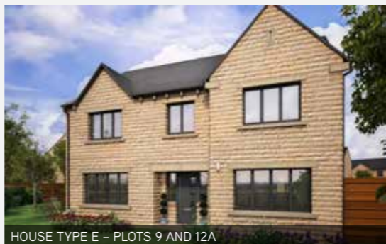
HOUSE TYPE E - PLOTS 9 AND 12A