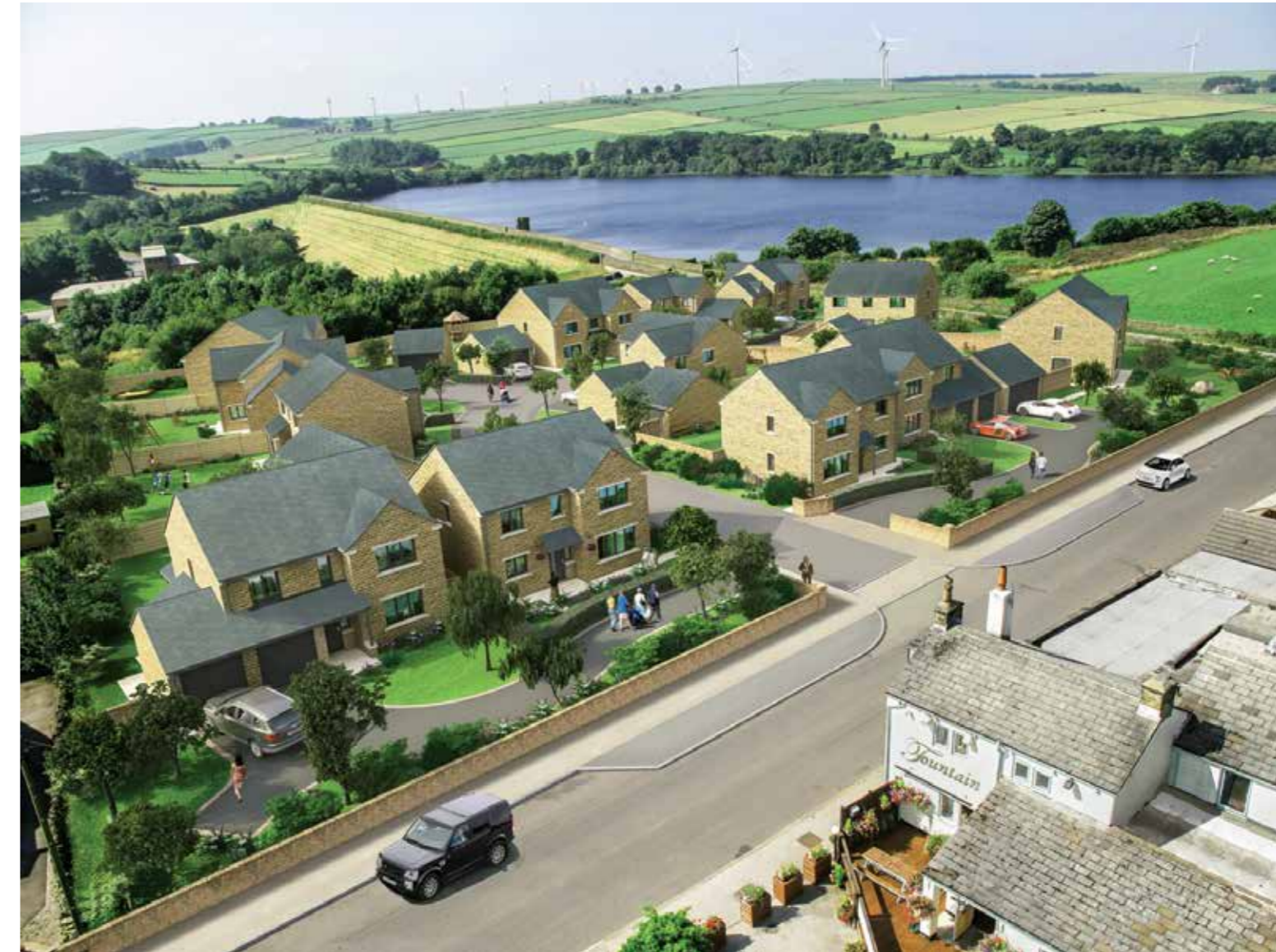
CGI of the SummerFord development