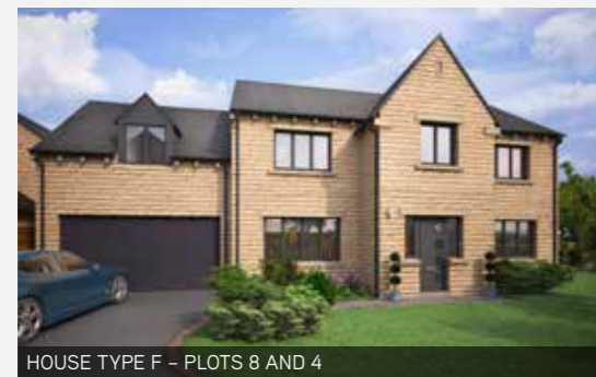
HOUSE TYPE F - PLOTS 8 AND 4