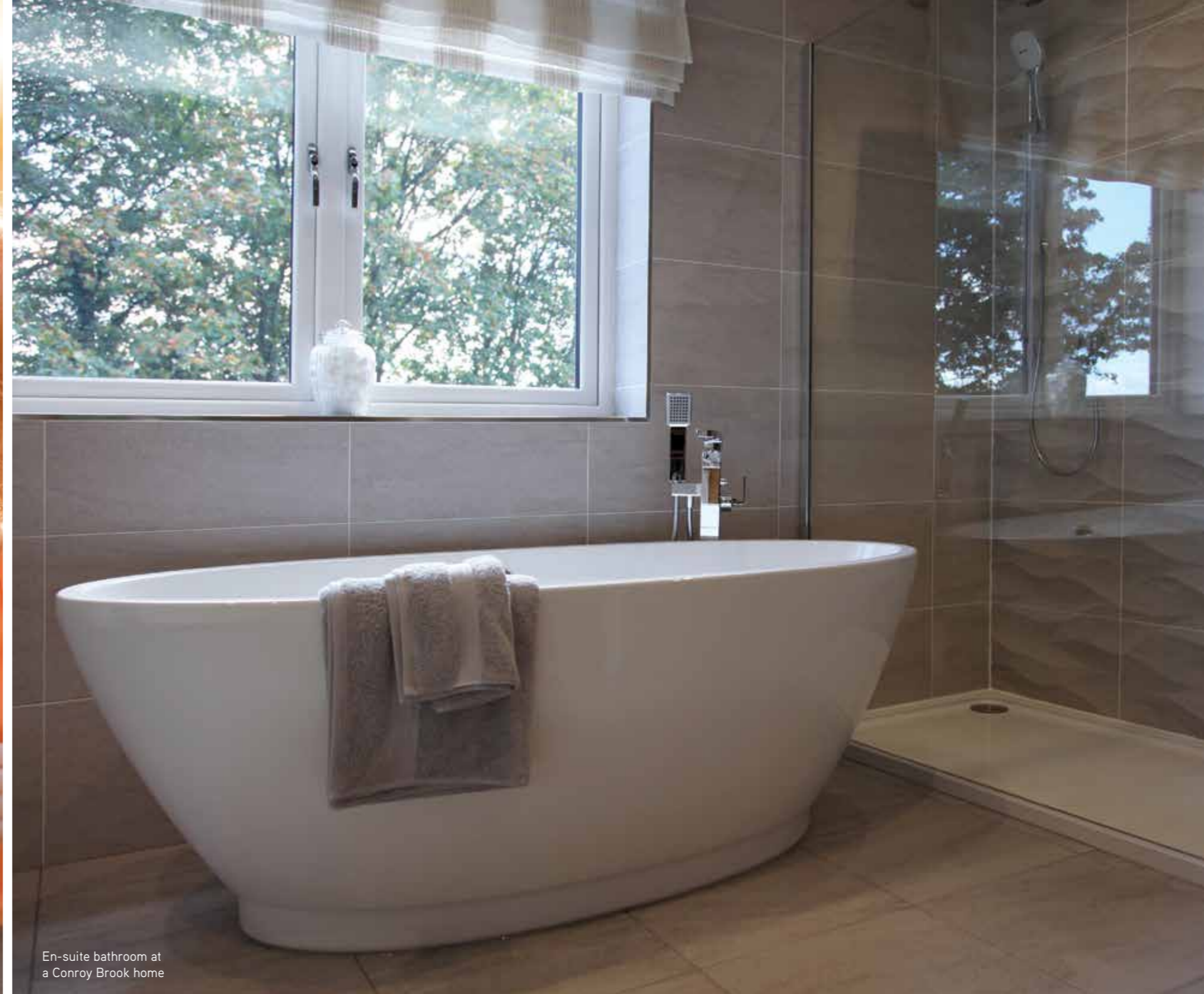
En-suite bathroom at a Conroy Brook home