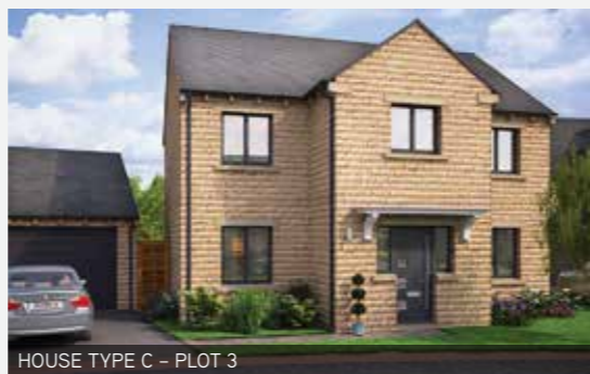
HOUSE TYPE C - PLOT 3